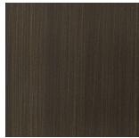
Brushed Dark Bronze