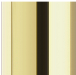
Metal Gold - Glossy