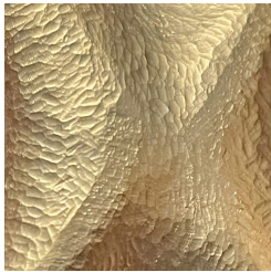
Metal Wrought Gold