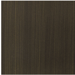
Metal Brushed Dark Bronze