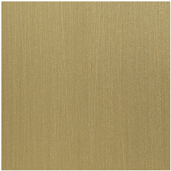
Metal Brushed Gold