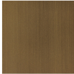
Metal Brushed Bronze