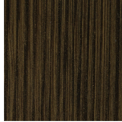
Oak veneered Dyed Wengé wood - Glossy