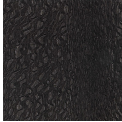
Grey Carbalho veneered wood - Glossy