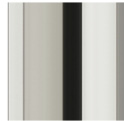
Metal Chrome - Glossy