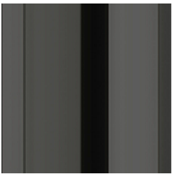
Metal Black Chrome - Glossy