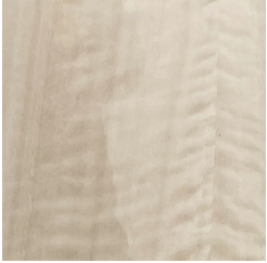
Eucalyptus frisé veneered wood - Glossy