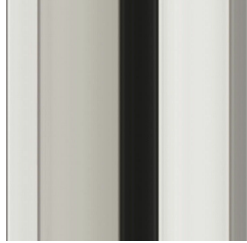
Metal Chrome - Glossy