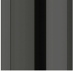
Metal Black Chrome - Glossy