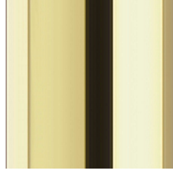
Metal Gold - Glossy