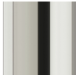
Metal Chrome - Glossy