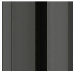
Metal Black Chrome - Glossy