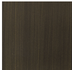
Metal Brushed Dark Bronze