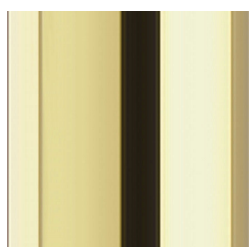
Metal Gold - Glossy