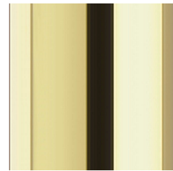
Metal Gold - Glossy