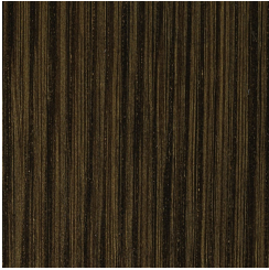
Oak veneered Dyed Wengé wood - Glossy