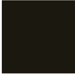
Dark Brown lacquered wood - Embossed