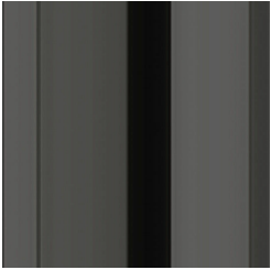
Metal Black Chrome - Glossy