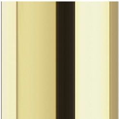
Metal Gold - Glossy