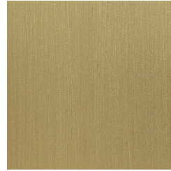
Metal Brushed Gold